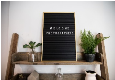
Above: The course in action.

at ease, helping prompt ideas during the practical components of the course, providing physical assistance where necessary and helping with refreshments. They were also an integral part of the community we formed as we all shared stories and jokes with one another.