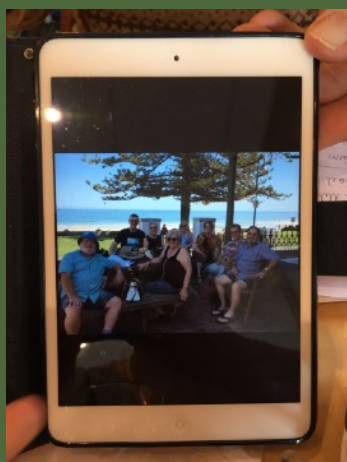
Above: before editing

"After the first lesson explaining what buttons do what on my camera I feel empowered."