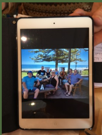
Above: after editing